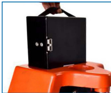
Easy to remove Lithium battery