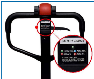
Battery Life Indicator